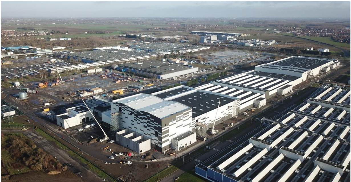
Gigafactory construction site in Billy-Berclau Douvrin