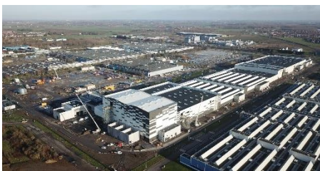
Gigafactory construction site in Billy-Berclau Douvrin